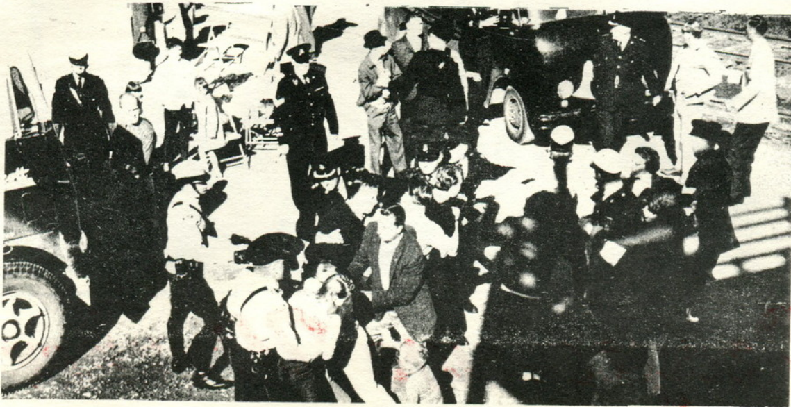
MILITANT WORKERS DEFY COPS AT TEAMSTER'S STRIKE

The strike at the Scott Transport is ended; and the manner of its ending served to underline the partisan role of Courts and police, again, as always, on the side of capital against labour. Less than 72 hours after a police detail had resorted to violence, and the arrest of women and children, in order to smash the picket line - and at the very moment when workers were standing in court facing a charge of unlawful assembly - the company officials made a complete capitulation, granting all demands of the strikers, and to openly admit that the workers were in the right from the beginning.